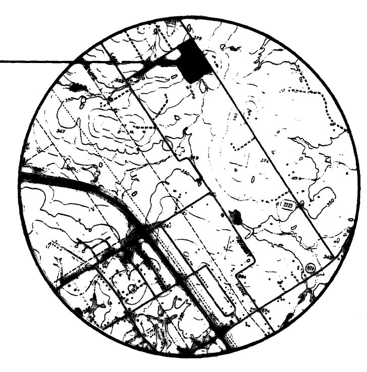
VICINITY MAP n.t.s.